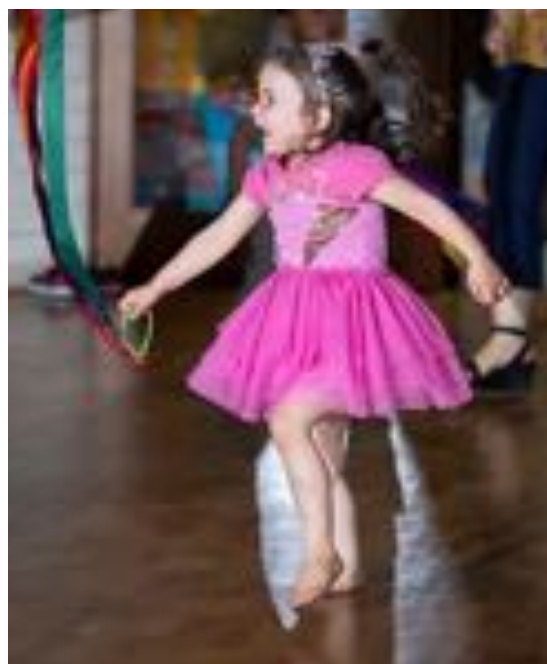
Photos from our Dance Party 2019