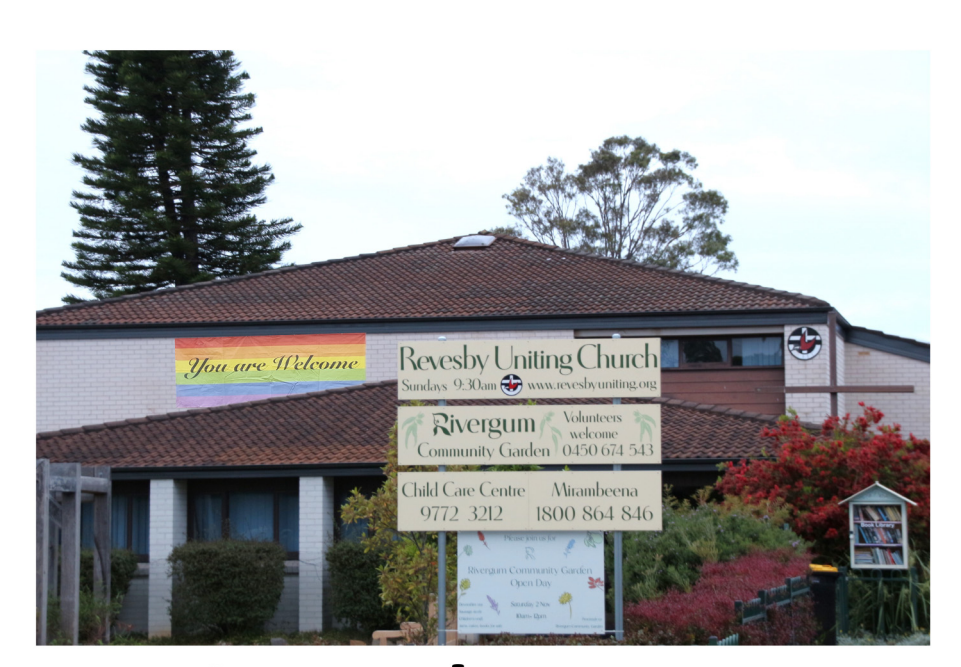
Annual Report October 2024